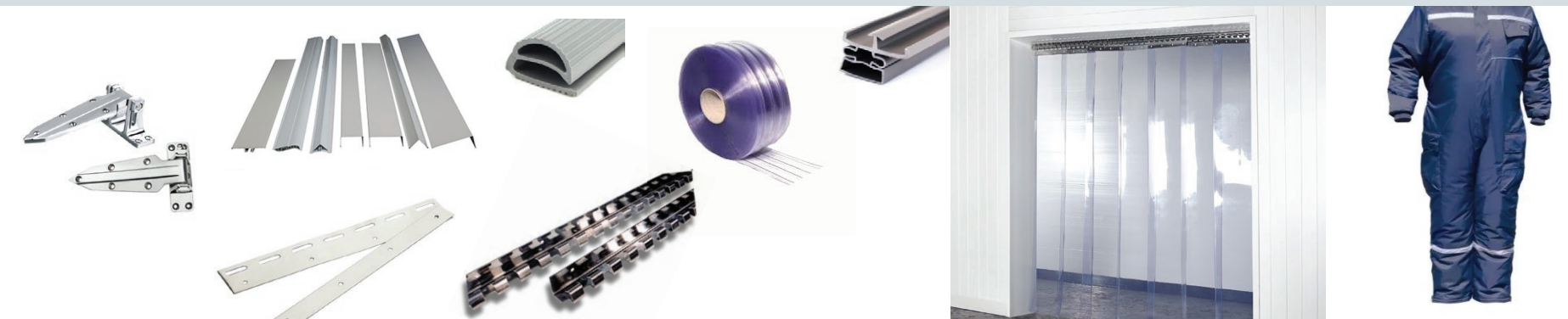
COLD ROOM ACCESSORIES