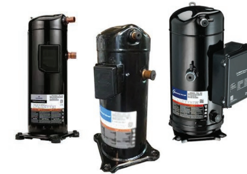
Scroll Compressor ZR/ZP/ZW/ZB Series