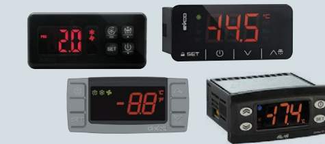
Refrigeration Digital Controls