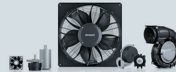
Fans and Blowers